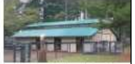
Country Valley Morgans

Large Stalls with Paddocks 60'X120' Indoor Arena Full Care, Daily Turnout Secure Fencing Heated Tackroom